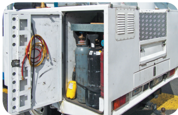
Purpose build sealed compartment